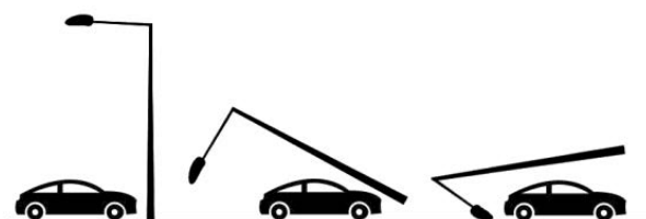
PASSIVE SECURITY | Class 100NE2 No Resistance